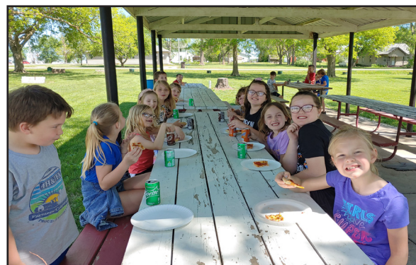
These second graders enjoy their pizza at the Lewiston Park May 16.