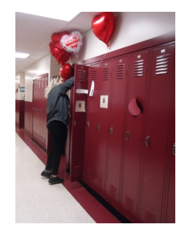
Delivering to lockers