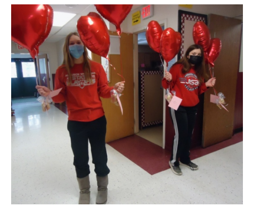
Heading out of the FACS room to deliver balloons