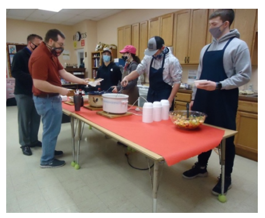
Serving the staff of Lewiston School.