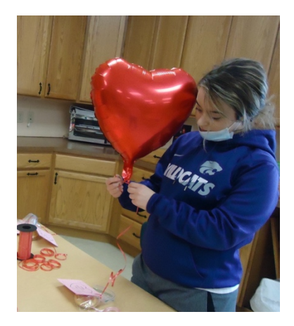
Putting together a balloon order.