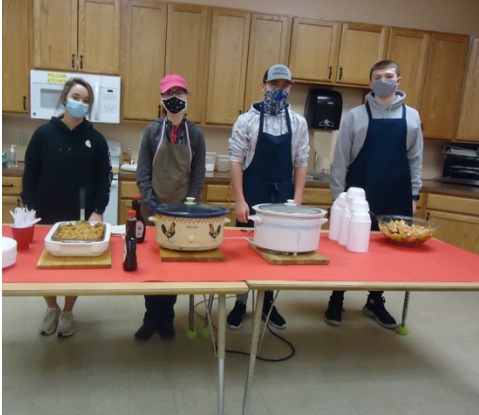
Serving line is set up and ready and waiting for guests.

LCS sponsored two events in February. Members provided the Lewiston staff breakfast on Wednesday, February 10. LCS members also distributed Valentine balloons on Thursday, February 11.