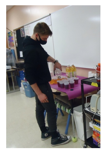
Filling juice glasses